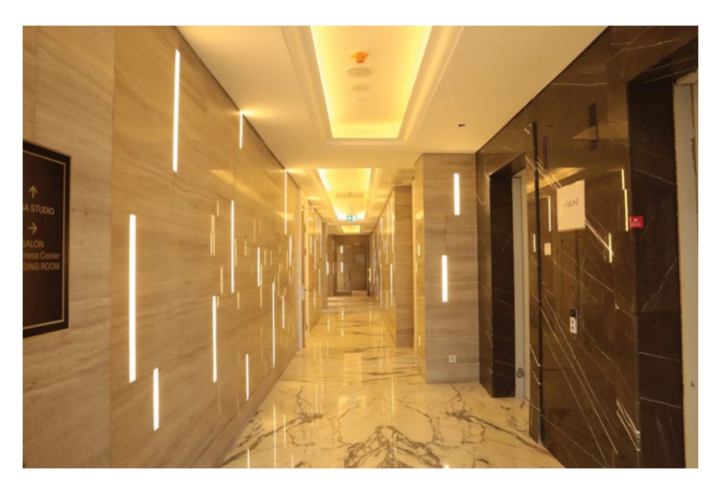
Corridor level 22 is 95% completed and the signage will be installed in May 2022