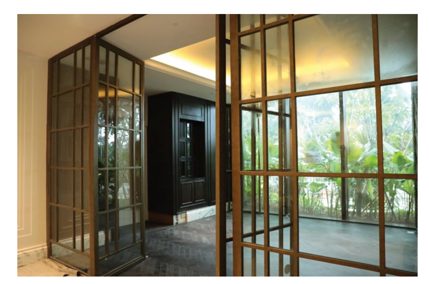
Wine & cigar lounge. Dedicated wine cellar will be installed in June 2022. Loose furniture will be set in end of May 2022