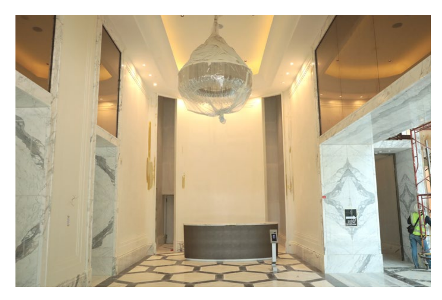
Lobby concierge is 90% done. Wall artwork by ISA Art and wall lamp will be installed in June 2022

The construction of the luxury apartment, The Residence at The St. Regis Jakarta at Jl. H.R. Rasuna Said is in progress.