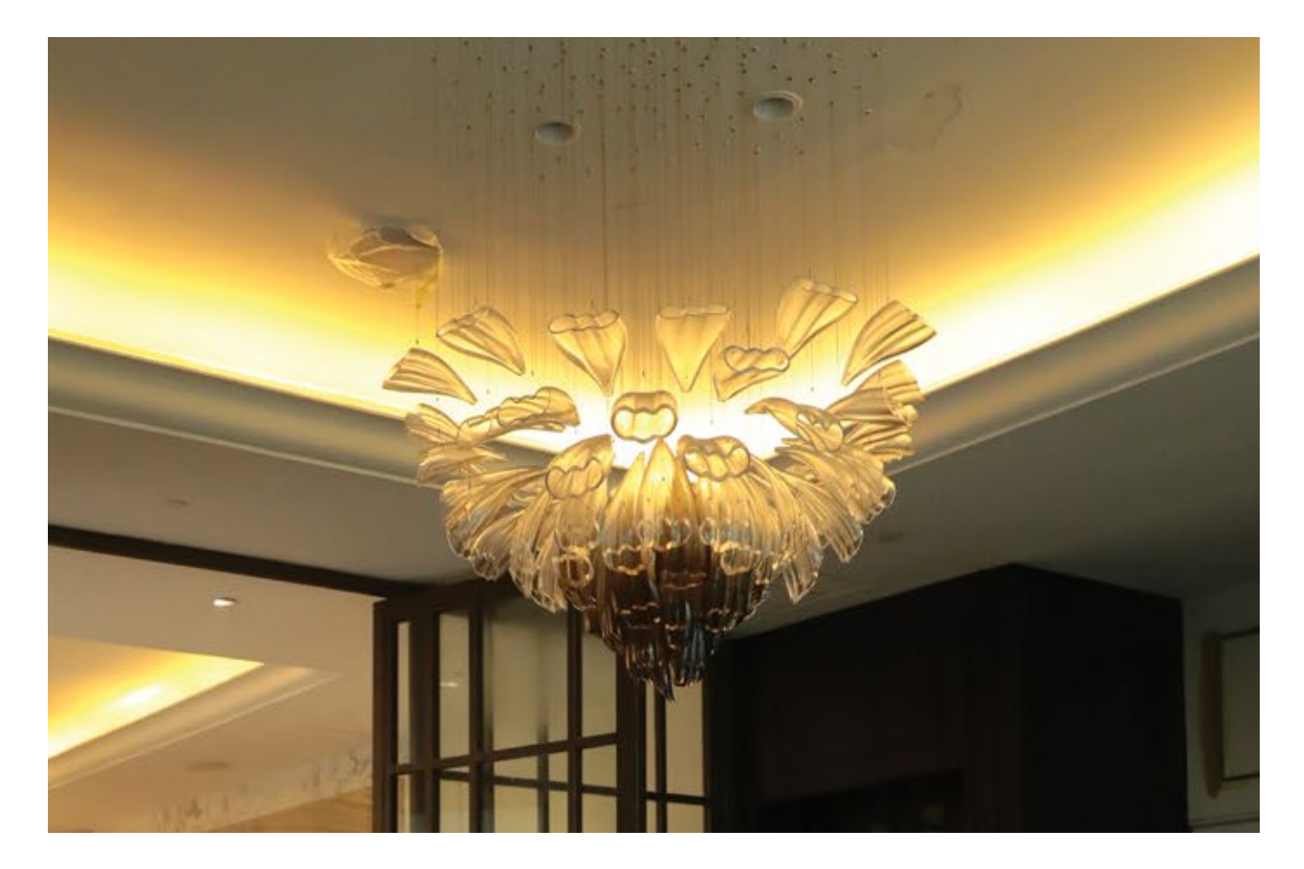
Chandelier by Lasvit are 100% installed in the lobby area